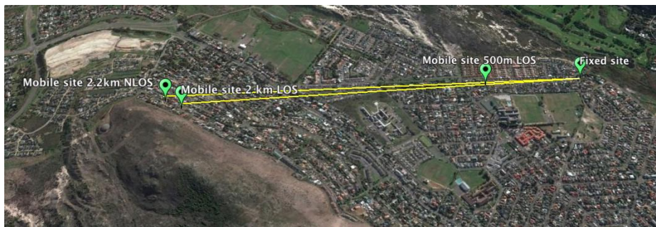
Figure 3: Location of outdoor test sites in Fish Hoek, Cape Town