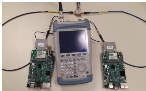
Figure 1: Cabled measurement setup using 60 dB of attenuation and a splitter to check performance of devices without interference and with various levels of attenuation