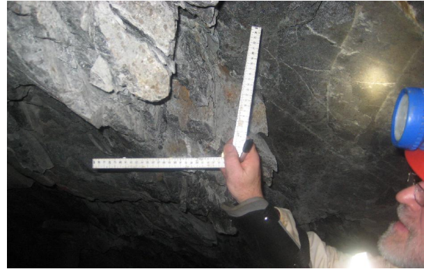
Figure 2. Mapping joints and fractures in a stope in Cooke #4 Shaft Pillar

an autonomous robotic platform (Durrheim et al., 2013). The ultimate objective of this work is to improve our understanding of the factors that affect the vulnerability of a stope to seismic shaking, and to develop practical systems to map the stope and guide proactive interventions that will reduce the rockburst risk.