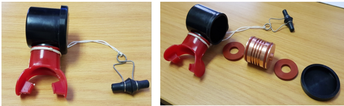
Figure 3. Expectation trainer (left) and components (right).

The purpose of the SCSR Expectation trainer is to improve the training and preparedness of underground mine workers in the use of SCSRs during emergency escapes. The unit simulates the experience of breathing from an SCSR, including factors such as elevated inhalation temperature, elevated resistance, and fitting of nose clips and goggles. The unit provides a realistic inhalation temperature ranging from 40°C to 60°C and a breathing resistance of approximately 1000 Pascal (10 mbar) for both inhalation and exhalation, simulating conditions similar to those encountered when using a real SCSR in an escape scenario. The Expectation trainer does not require chemicals and can be disinfected and reused. Images of the training unit are shown in Figure 3. Overall, the application of the Expectation Trainer serves to enhance miners' understanding of and proficiency in using SCSRs during underground emergencies, improving their chances of successful escape.