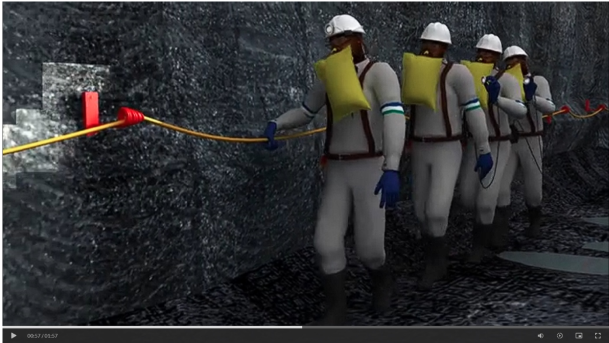
Figure 1. Example of content in the lifeline and rescue bay training module.

Topics covered in the e-learning modules, relating to catastrophic explosions and the prevention thereof, are listed in Table 1. Examples of content relating to the lifeline procedure and SCSR modules are shown in Figures 1 and 2. Benefits of the e-learning modules are that it is self-paced, and can be completed anywhere, provided there is access to a device with internet connectivity.