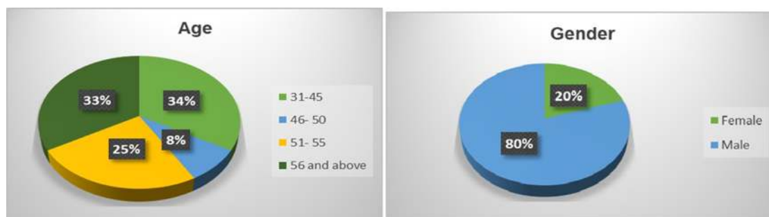
Figure 1: Age groups and gender of participants in the sweet potato value chain survey

Most (75%) of the sweet potato farmers and processors who participated in the survey have attained education at college or university level (Figure 2). Additionally, 17% have high school qualifications while 8% of the participants did not go beyond primary school level. This suggests that the level of education of sweet potato producers and processors in this study was not that low and this may have a positive impact on their farming practices, yields and post-harvest handling activities of the crop. The higher percentage of sweet potato farmers with college or university