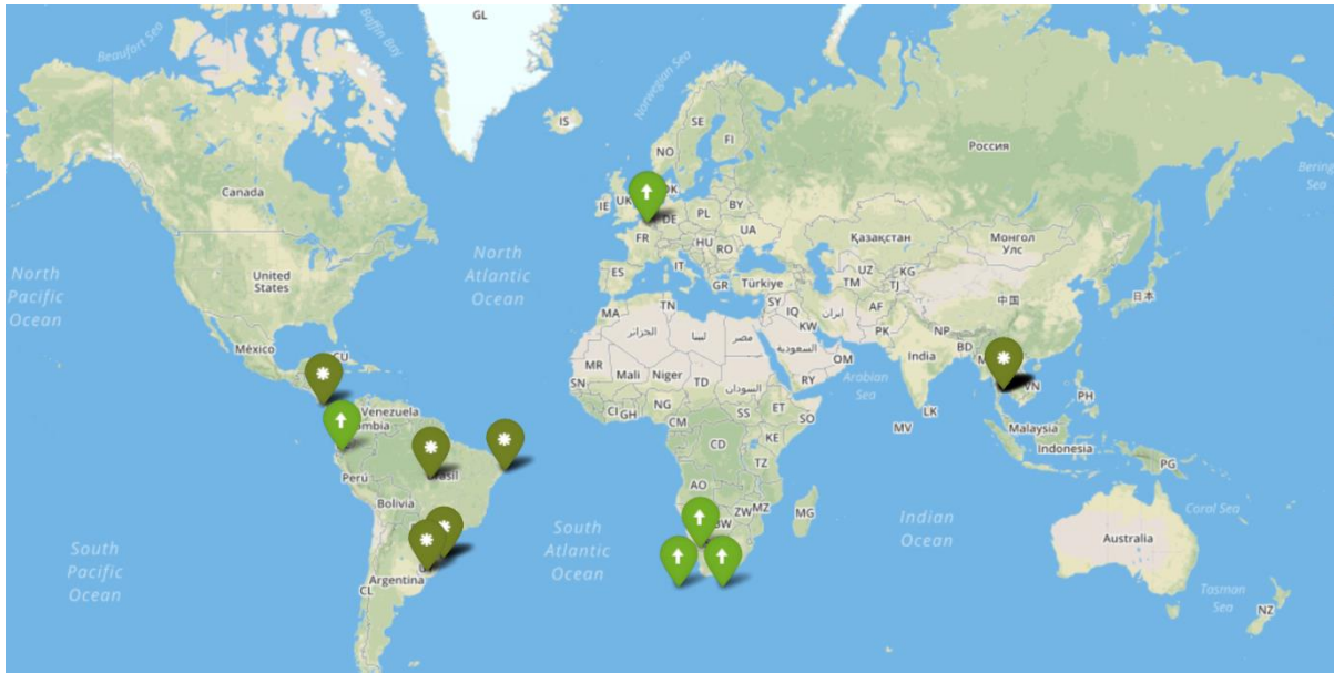
Figure 2: Location of the Global Mconf web conferencing servers (2015c: Internet)