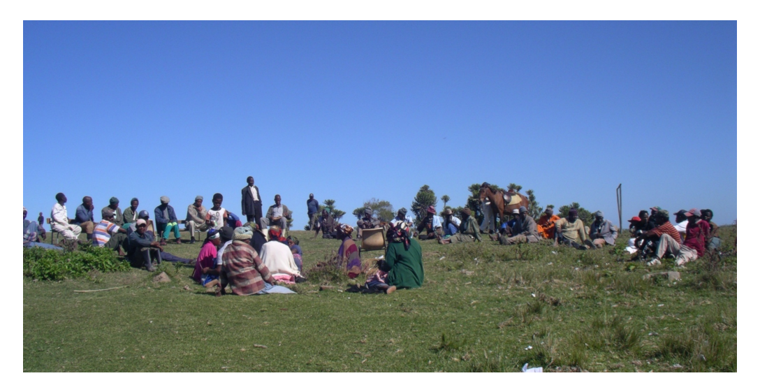
Figure 1: Headman of Lwandile oversees a village meeting.

methodologically (Crabtree et al., 2009). Our 'real' ethnography involves detailed analyses of what people do and how they organize action and interaction in their daily lives and, where possible, local views about actions. We do not think of such immersion as either 'hanging out with' locals or 'talking to' users; instead, we aim for a rigour in participant observation, dialogue and iterative processes of writing and reflexivity. That is not to say we have not used particular theoretical lenses, such as phenomenology, as rhetorical tools to emphasize elements in this context and motivate general design sensitivities (e.g. Bidwell, 2009). However, it is the fine details of what people did in the rural setting, depicted in our ethnography, that influenced our decisions in arranging and conducting a workshop and creating the technology probe.