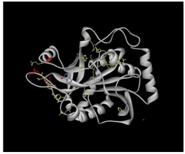
Figure 2: Ribbon representation of the homology modelled three dimensional of BHPNP1 structure Modelling of the BHPNP1 structure was performed using the bovine structure 1VFN6 as a template. The monomeric subunit was modelled along with the substrate, hypoxanthine using Accelrys Discovery Studio 2.0.