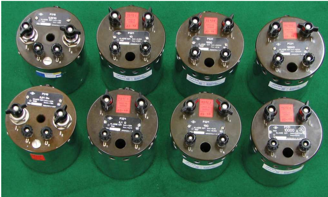
Figure 1: The set of recently acquired resistors.

Experiments with measurement with different excitation currents are also planned. The oil will produce significantly better cooling compared to having the same resistors in air, and the differences between measurements at different power levels will be interesting. It will also allow the measurement of client resistors at these higher powers with reduced system uncertainties.