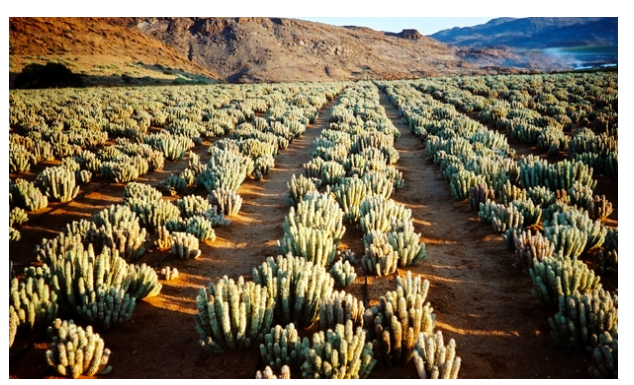
Figure 1. Hoodia cultivation site

Hoodia is a scarce succulent plant not easily cultivated. The CSIR's licensee has transferred technology for the controlled horticulture of the plant to South Africa, in line with the requirements for Good Farming Practice. Currently Hoodia is being cultivated as part of this programme on different sites in arid regions of the country. Local communities are involved in the cultivation programme.