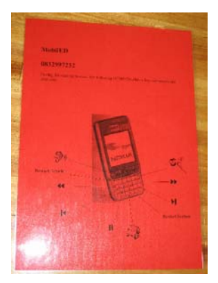
Figure 2:Handout given to the learners showing how to navigate the audio wikipedia

The results of the information retrieval and discussions were then reported back to each audiocasting group. The audiocasting group then discussed the most relevant issues of HIV/AIDS for their own age groups and communicated the results to the school community as an audiocasting show that was recorded via MobilED onto the wiki. To access the audio encyclopedia and the audiocasting service, the students used shared Nokia 3230 phones with speakers.