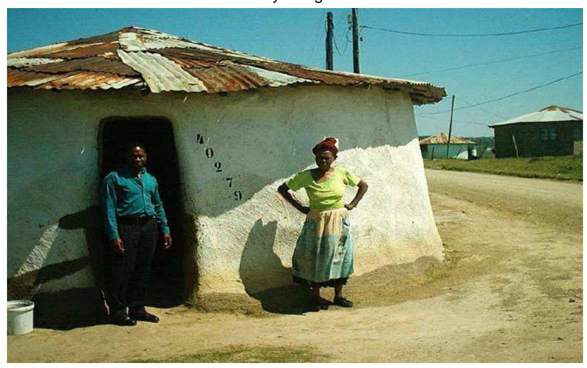
FIGURE 3: A newly-assigned rural address

The value of addresses to governance is illustrated in quite a few ways in South Africa. First of all, the Independent Electoral Commission (IEC) makes extensive use of addresses in preparing for any election in South Africa. For example, addresses are used to make sure that voting stations are within reach of the voters, and also to analyse voting patters after elections. Any trends that are picked up are used to rectify voting station boundaries for subsequent elections. For example, if quite a number of voters in close proximity used an adjacent voting station instead of the one they were allocated to, the voting station boundaries are adjusted accordingly.