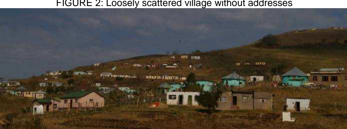
FIGURE 2: Loosely scattered village without addresses

cases, addresses have not yet been allocated in any of these areas (see Figure 2). The Department of Land Affairs, which is responsible for the cadastre and deeds register, has embarked on a national land reform programme to address tenure security, restitution of land to people dispossessed by racially discriminatory laws or practices, and land redistribution to the poor (Adams, Sibanda and Turner, 1999).