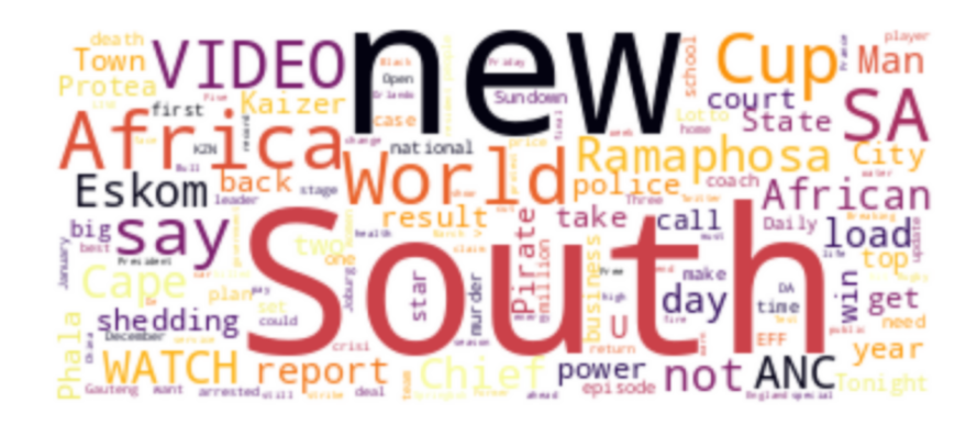
Fig. 2: Word cloud of the data.