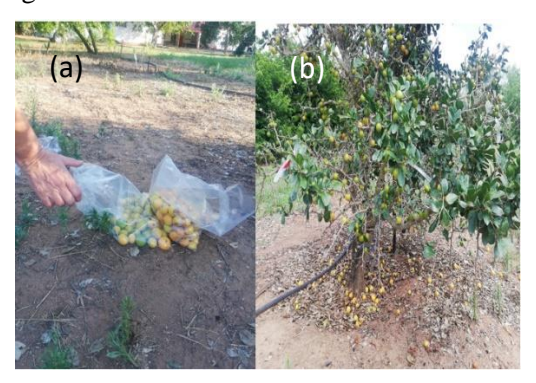
Fig.1 An indigenous fruit tree showing (a) fruit collected into plastic bags and (b) tree with fallen fruit

After the selection of these species, the next step was to identify suitable study sites and instrument the trees with water use monitoring equipment. Sap flow was measured using the heat ratio method (HRM) of the heat pulse velocity sap flow technique [2]. Leaf gas exchange measurements were taken using an Infrared Gas Analyzer while Root- and branch-level sap flow was quantified using the HRM. The water use efficiency of the species was calculated as the kilograms or grams of fruit produced, per-litres of water consumed; WUE = Fruit yield / Water consumption. To sample fruit from the indigenous trees, when the fruit had reached a ripening stage, they fell randomly under the tree, they were then picked up as they were counted as shown in Fig.1. To determine fruit mass, the fruit were measured in the lab using vernier calipers. Further analysis included plotting correlations between the water use and climate.