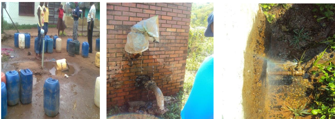
Figure 2: Damaged pipes and leaking valve at the borehole

Poor operation and maintenance of infrastructure. In almost all the project sites there was some infrastructure in place which ranged from reservoir, borehole pumps, reticulation pipes, street taps and others. However, most of the infrastructure in the selected project sites was poorly maintained (See figure 2). Some of the infrastructure problems included leakages (reservoirs, pipes, and taps) either due to damage or aging. In some areas tap heads were damaged or stolen. The poorly maintained infrastructure will in turn affect water supply as there will be a lot of water losses during the distribution period. Poor operation and maintenance of boreholes is a major problem in the selected areas as boreholes would have a significant reduction in terms of their expected yields. Hence, other boreholes fail to meet the expected demand. Some challenges relating to infrastructure are indicated in Figure 1 below: