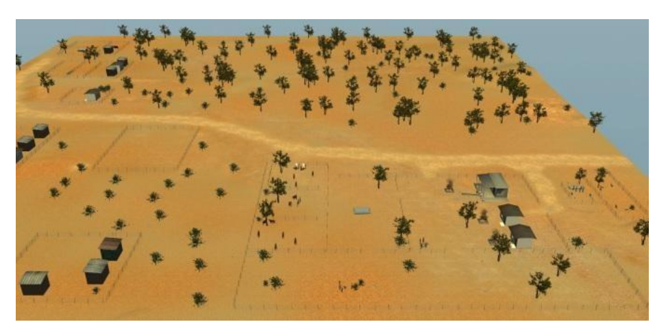
Figure 1 The visualization including all the 3D objects constructed from references in the village.

The current prototype was conceptualized and built by two new members of the project team (Authors 1 and 4) during their first visit to Namibia in collaboration with researchers involved in the research programme from its inception, including a Herero man from the village (Author 6). We modeled the village from Author 6's specifications and by using reference photos and videos depicting specific landmarks [23], including Google Maps satellite images. We created the visualization using the Unity 3D game engine. The visualization consists mostly of trees and bushes and a few man-made objects, such as houses, fences, water-pump, fire places and car tracks (see Figure 1) which marked specific locations as we saw on photos and videos. We populated the static environment with animals and people.