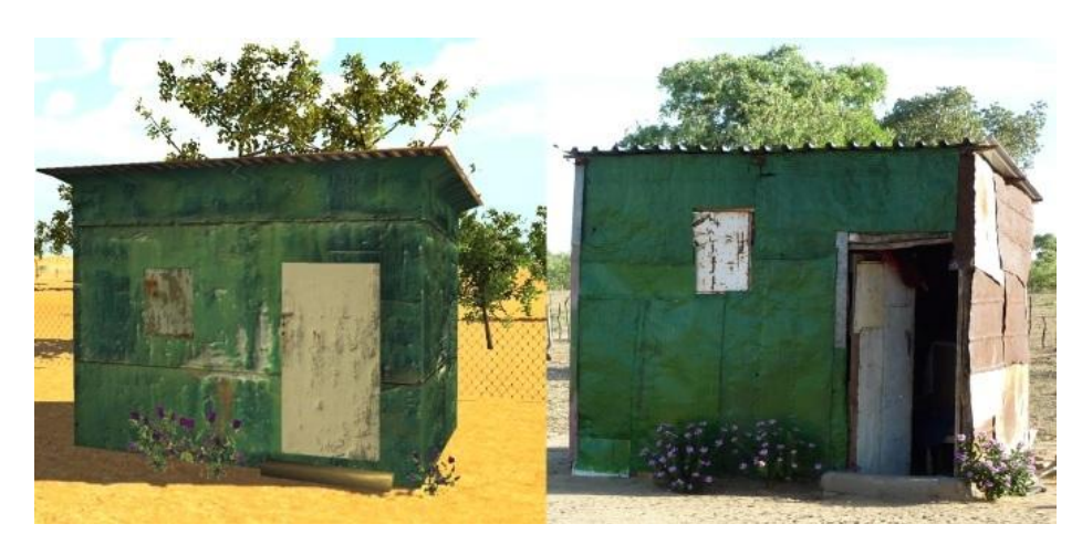
Figure 2 The house on the left is a 3D visualization of the right.