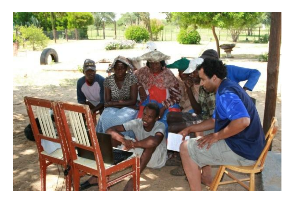
Figure 5 We demonstrated the system to 8 rural residents including 2 Elders.

The Elders observed the resemblance between the visualization and where the evaluation occurred; however, commented on the visual accuracy of the features. For instance, when discussing the scenario near the cattle in the kraal, the Elders told us that planted trees do not grow inside the kraal and added: "It's not a planted tree, it's a wild tree (Otjindanda), just look the way it grows!" Our (the developers) unfamiliarity with local culture and environment meant we lacked an appreciation of visual differences between cultivated and wild trees or where they might grow and made many assumptions when we drew upon reference images. Our lack of visually differentiating trees made the setting less legible to the Elders. This indicates that they not only understand the visualized objects but also recognized the importance of placing objects. Lack of visual accuracy sometimes caused the Elders' frustration and uncertainty about their own memory of the setting; for instance, based on photos we modeled one block of concrete, where villagers lay their fire, in front of a house. However, this hut has two blocks of concrete.